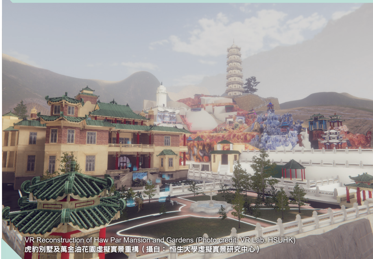
VR Reconstruction of Haw Par Mansion and Gardens 虎豹別墅及萬金油花園虛擬實景重構