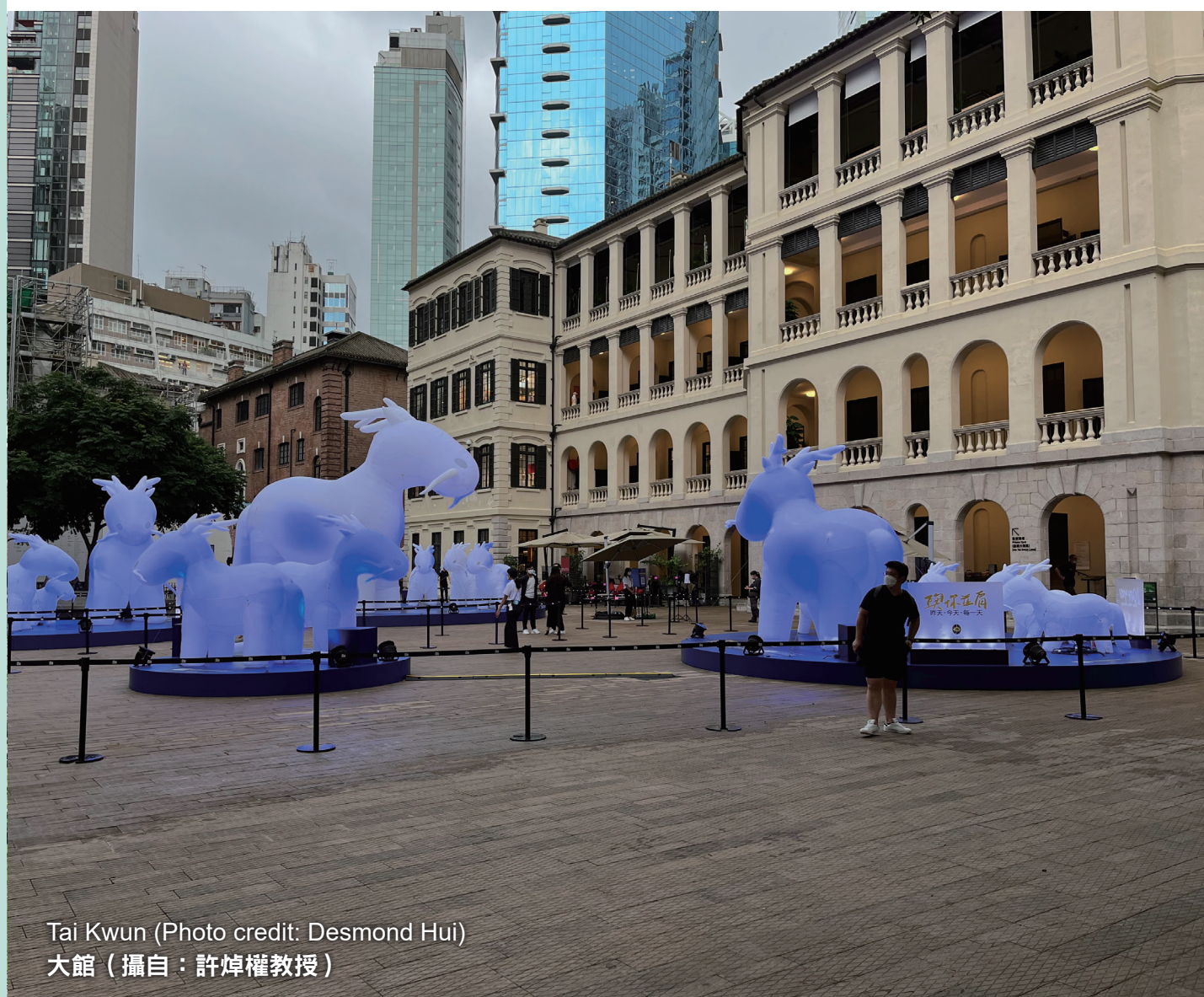
Tai Kwun 大館